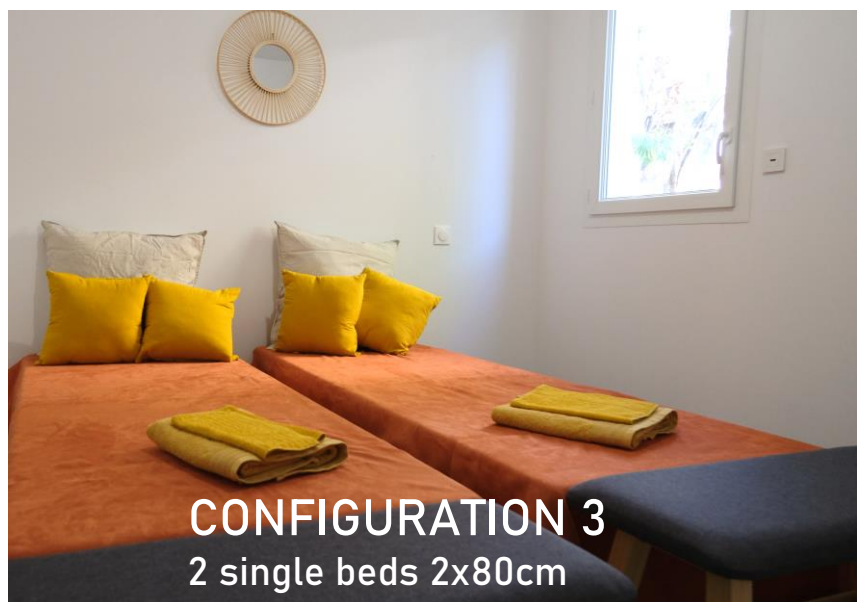
CONFIGURATION 3 2 single beds 2x80cm