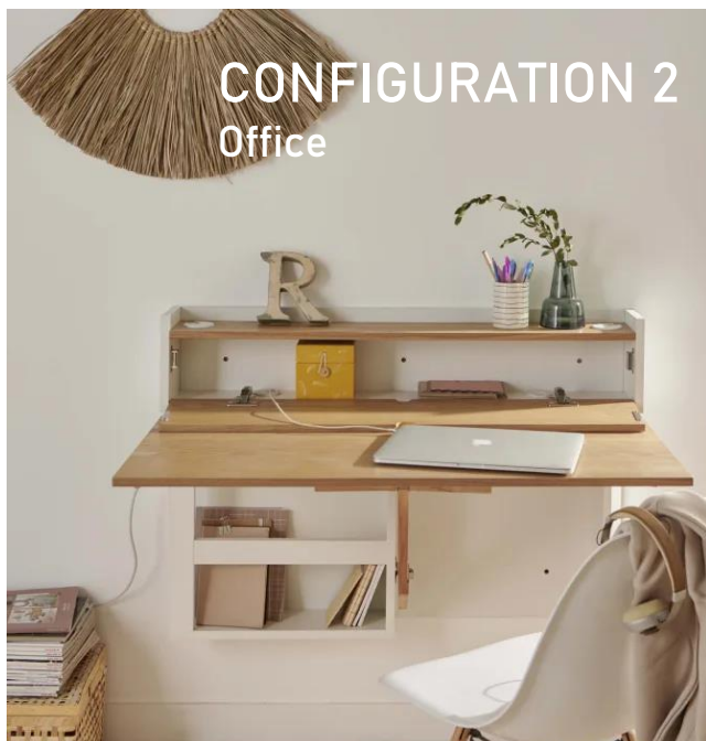
CONFIGURATION 2 Office