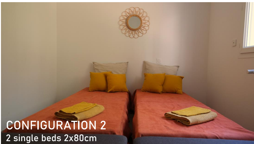
CONFIGURATION 2 2 single beds 2x80cm