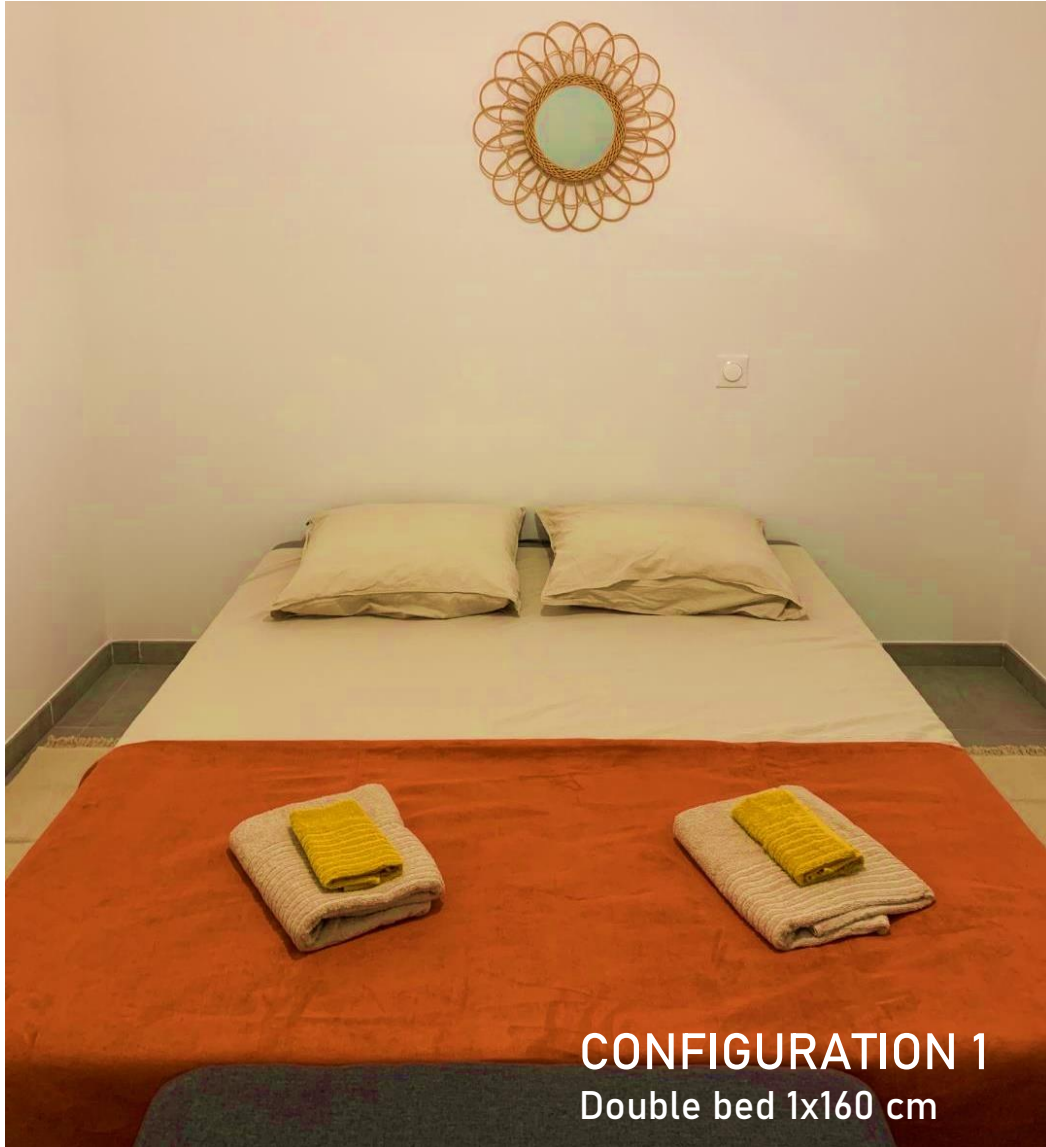
CONFIGURATION 1 Double bed 1x160 cm