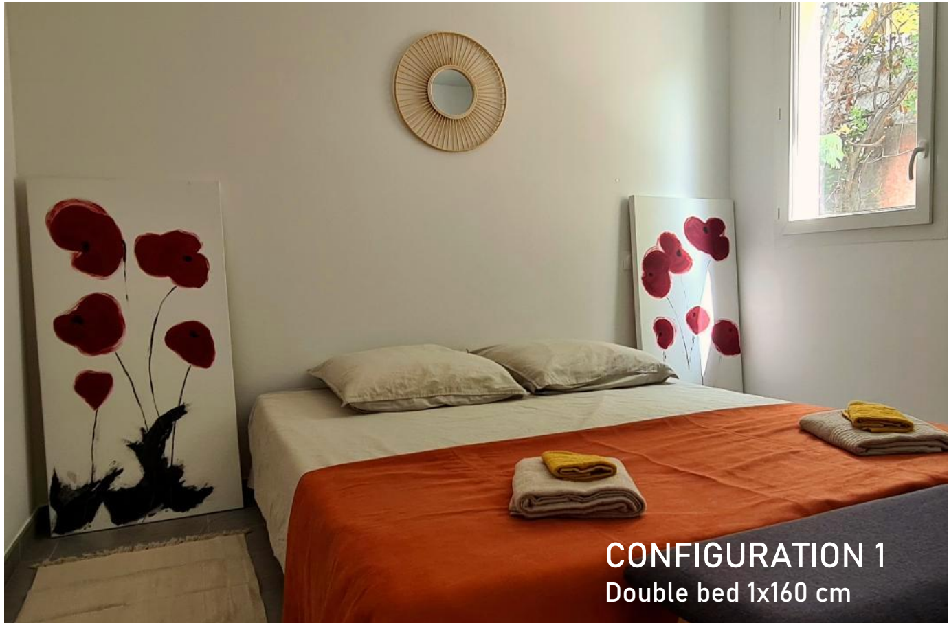
CONFIGURATION 1 Double bed 1x160 cm