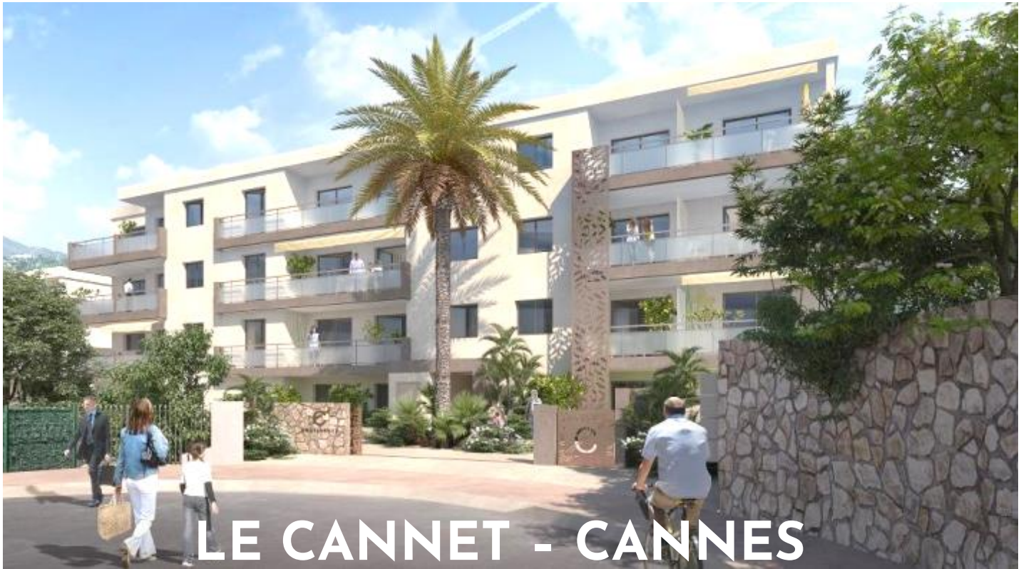
LE CANNET - CANNES